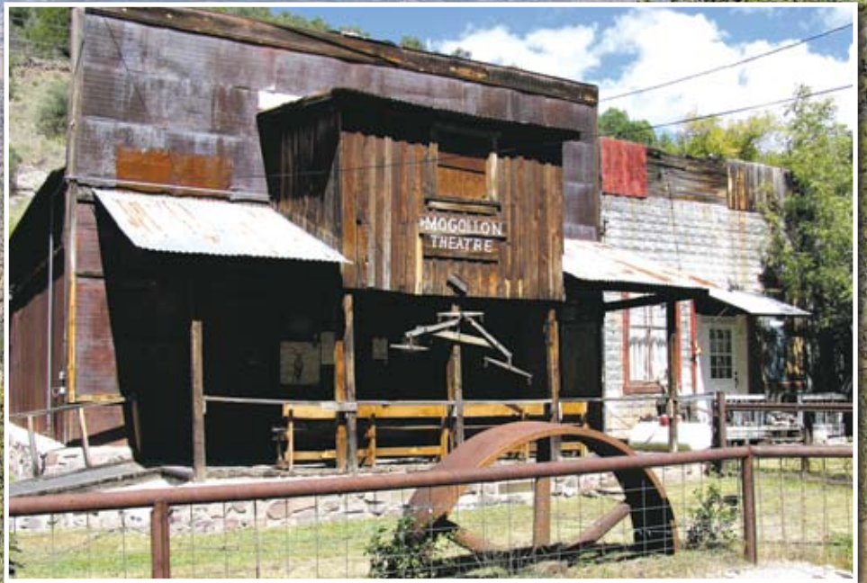
Left, sign for WS Land and Cattle Company in present-day Alma, New Mexico; right, Mogollon Theatre, where dances were held